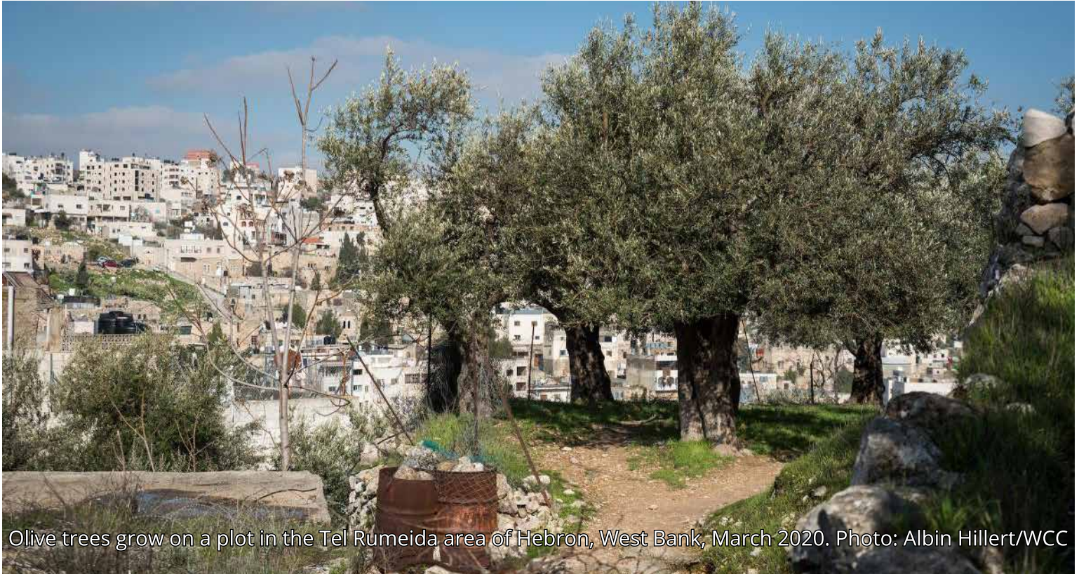
Olive trees grow on a plot in the Tel Rumeida area of Hebron, West Bank, March 2020.