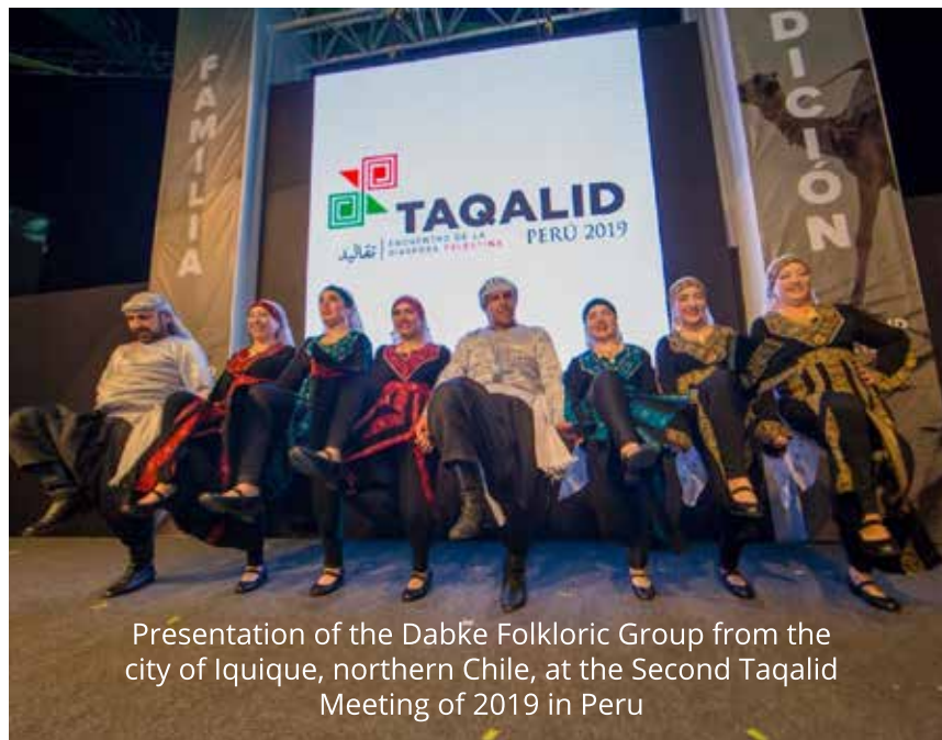
Presentation of the Dabke Folkloric Group from the city of Iquique, northern Chile, at the Second Taqalid Meeting of 2019 in Peru

For this reason, we are also aware of the need for unity among our people and the need to act jointly. Recently, we have been generating links with other communities in the Diaspora. A few years ago, in the Palestinian Club of Santiago, we organized a convention, «Taqalid» (traditions), to bring together the Palestinian communities of Latin America around the Palestinian culture and identity. Thousands of people from different Latin American countries arrived in Santiago in 2017 and to Lima, Peru, in 2019. Both gatherings were very successful. Ours is a process that seeks to reactivate other communities, get to know each other, and insist that the Palestinian Diaspora must play an important role, not only sharing information about what happens in Palestine and as a supporter of the culture, but also as active members of the Palestinian community—a decision maker. We are part of the Palestinian people. We must participate in their decisions.