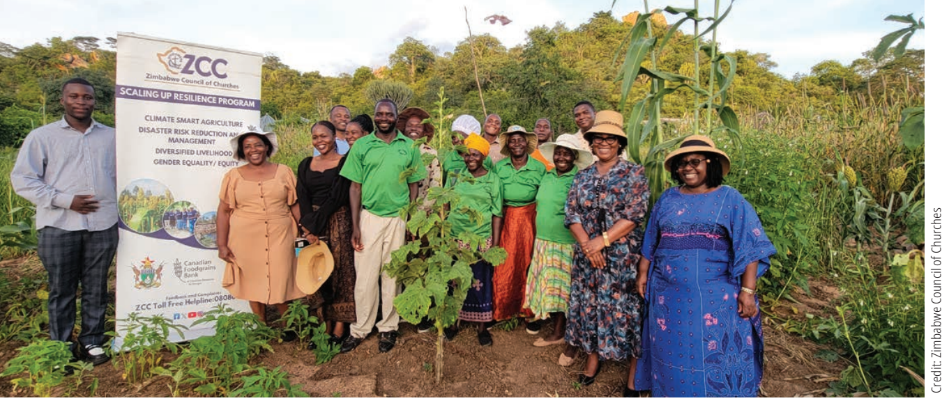
The Zimbabwe Council of Churches team visits the project of the "Scaling Up Resilience" project in partnership with the United Church and Canadian Foodgrains Bank.