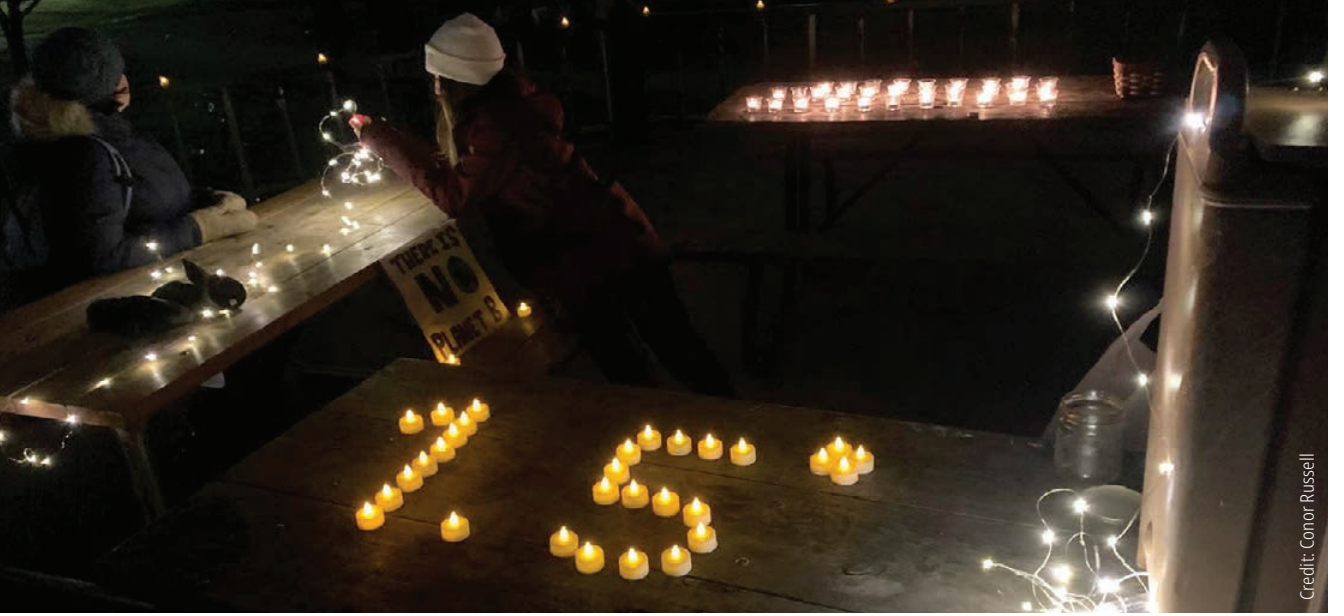
COP28 Candlelight Vigil held in Guelph, Ontario, December 2023.