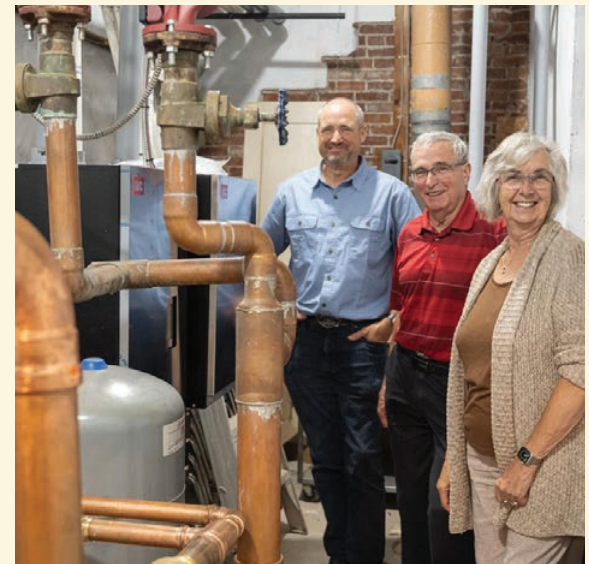
Project team standing near newly installed HVAC system at Smithville United Church, Smithville, Ontario.