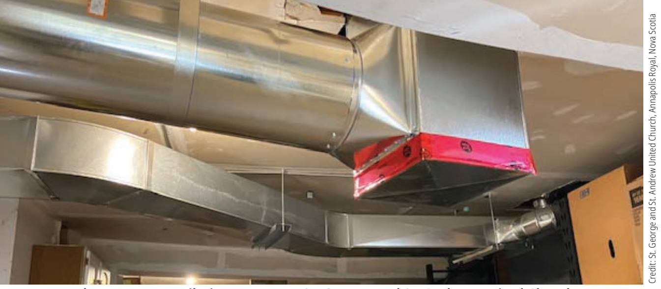
New heat pump ventilation system at St. George and St. Andrew United Church.