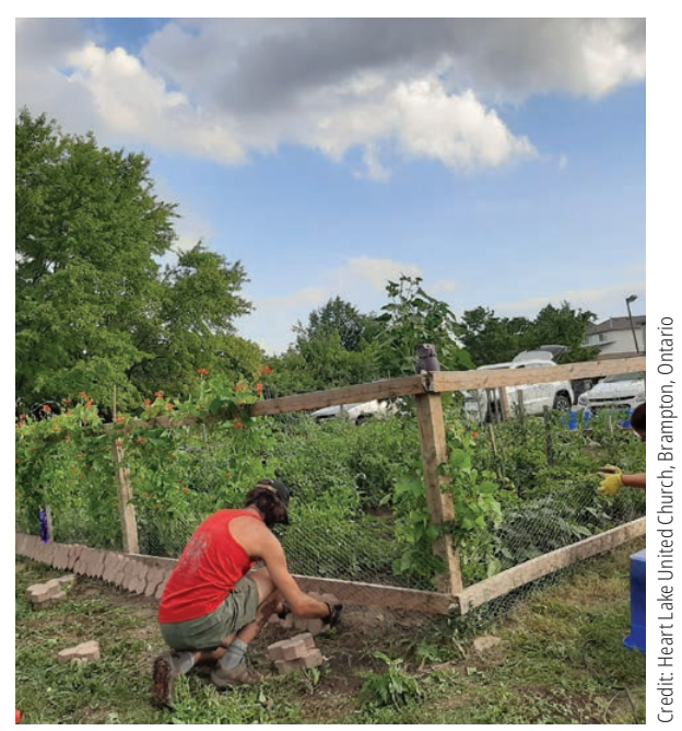
Members of Heart Lake United tending to its community garden.

Communities of faith are using their land to grow local produce, reducing reliance on imported food, minimizing transportation and packaging, and supporting community access to fresh, healthy produce. In 2023, Westminster United Church in Orangeville, Ontario transformed its landscape, replacing grass with no-dig food gardens aimed to lower its carbon footprint. Communities including Okanagan Falls United Church, British Columbia, Trinity-Clifton United Church in Charlottetown, Nova Scotia, and Heart Lake United Church in Brampton, Ontario have opened free community gardens. Heart Lake United donated hundreds of pounds of fresh produce to the Heart Lake Community Food Cupboard to tackle food insecurity.