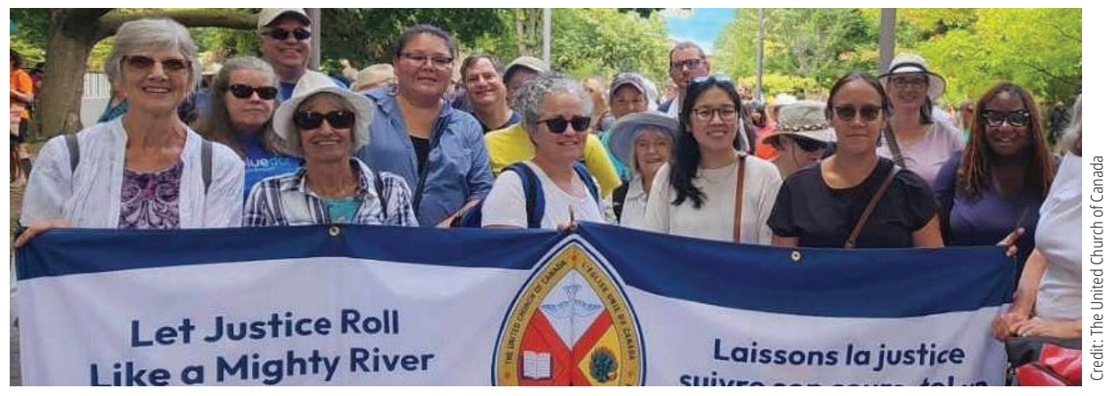
THE UNITED CHURCH OF CANADA | 2023 and 2024 Sustainability Report

United Church of Canada members and staff join River Run, led by youth and elders of Grassy Narrows First Nation for Mercury Justice.