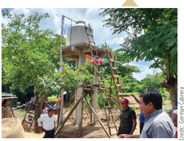
A newly installed solar-powered water pump in Champerico, Guatemala.

CIEDIG's initiative, in partnership with the United Church, strengthens Indigenous leadership, food security, and community development by enhancing the capacity of local churches and social organizations. Through partnerships like these, the United Church is helping build resilient and sustainable infrastructure and systems that support communities in becoming more self-sufficient, both locally and internationally, in the face of climate impacts.